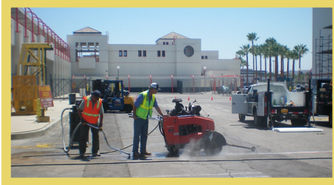
MicroDuct Slot Cut Work at POLA

inside plant work in the passenger waiting and staging area. After the MicroDuct was placed, BSE used the breeze machine to blow two each 12 strand single mode fibers from each of the respective building equipment rooms without any splicing or db loss. This project was overbuilt leaving the ability to come back in later and install an additional 48 strands of fiber between the buildings and 24 additional strands inside the buildings. Guy Sanford and Richard Viveros did an outstanding job of getting in and getting out of the site, leaving a quality product for the Port Administrators to use in their selection process for the forthcoming build-out.